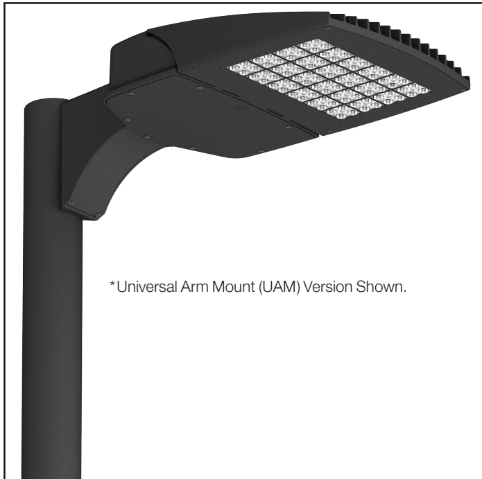
*Universal Arm Mount (UAM) Version Shown.