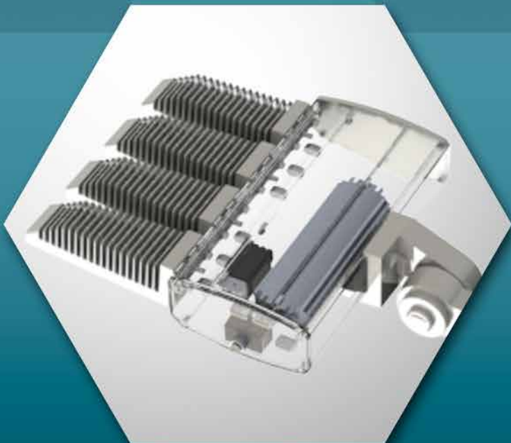
Top View Detail

High performance with a power factor greater than 90%, and rated for -40° C operation.