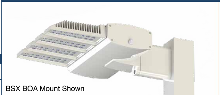
BSX BOA Mount Shown