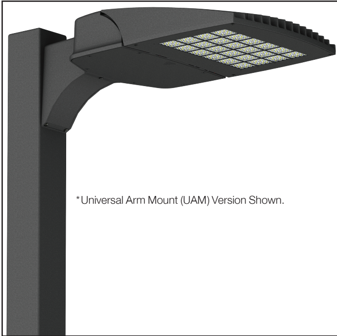
*Universal Arm Mount (UAM) Version Shown.